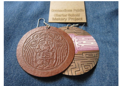
These products made by CPCS middle & high school students feature original designs lasered onto veneer & reused boxboard.

Please look for pictures of our recycled products made from plastic bottle caps in the near future.