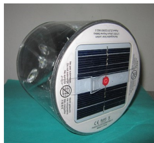
Portable inflatable SOLAR LANTERN $25

Recycle Hawaii, PO Box 4847, Hilo HI 96720