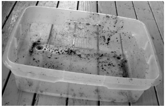
Bottom bin has no holes, so drainage water is contained and can be added to compost or used for irrigating plants.

Be sanitary—wash your hands after working with a worm bin.