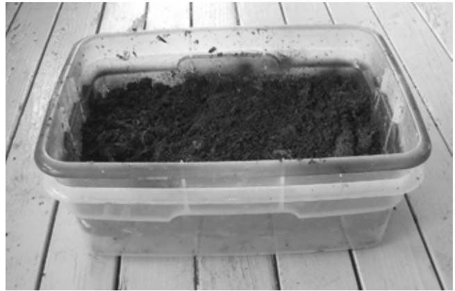
Finished compost, a uniform, loamy material in which no food scraps are identifiable.

Worm composting is easy, fun, and educational. If done correctly, the composting system will have a pleasant, earthy smell. In fact, the worms eat the bacteria that cause bad odors. If there is a smell, conditions are not right in the bin (see the troubleshooting table on page 4). Check the drainage bin regularly. Worm leachate should be discarded and never allowed to back up into the center bin.