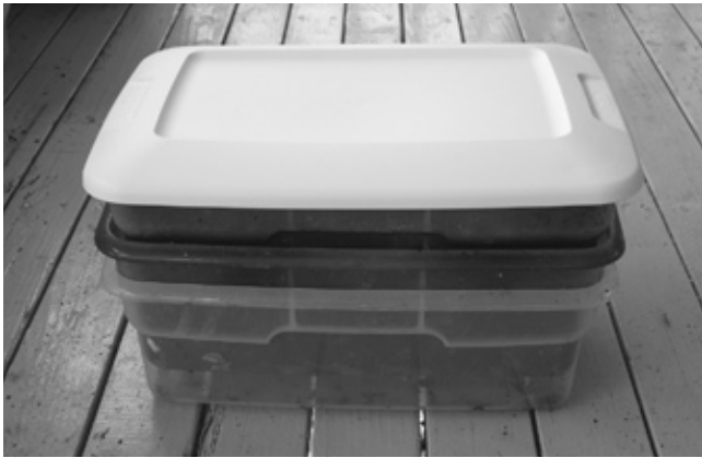
Vermicomposter with three nesting bins. Bottom bin collects drainage. Initially, bedding, food, and starter worms are placed in the top bin, while the center bin remains empty.