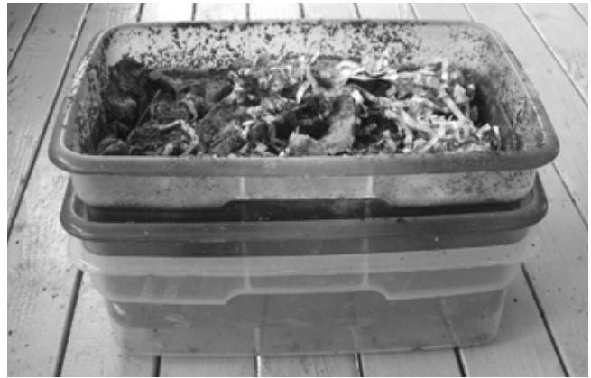
Top bin prepared with bedding and food scraps. Bins shown are approximately 17 x 12 inches.